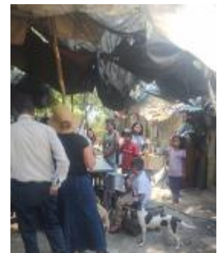
Our Workers Visiting a Family on One of Our Poor Routes

LOCAL CHURCHES MULTIPLYING LOCAL CHURCHES