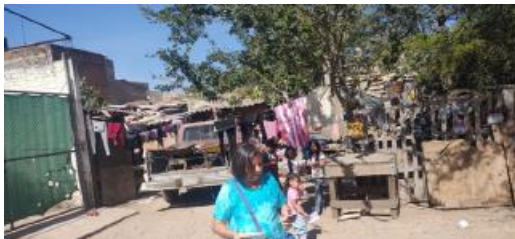
One of Our Workers in a Very Poor Area

We are planning a special Christmas service for December 22. We want to bring in many new families to our main church. We will be reaching out to many needy areas with our routes. We will be giving away toys and bags of groceries in the service. We will also be serving a large meal. Our main goal is to bring them in to hear the Gospel. “Blessed is he that considereth the poor: the LORD will deliver him in time of trouble.” (Psalm 41:1)